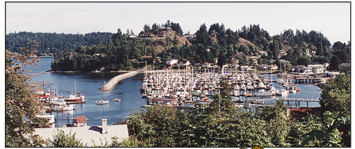
Top: At the city marina in Gibsons. Above: The store at Gibsons Landing marina. Above right: View of the docks.